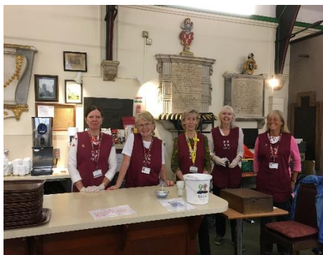
Our volunteers managing the refreshments