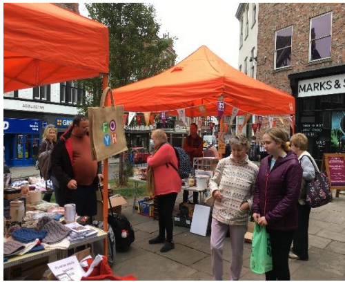
Some of our many customers on the day